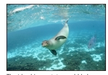
The islands' new status could help endangered monk seals rebound.

JAN TENBRUGGENCATE | The Honolulu Advertiser