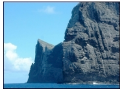
The boundary will start near Nihoa, the island closest to the main island chain