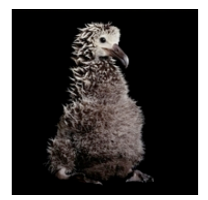
Laysan albatrosses live on Midway, the one spot that may allow public access.