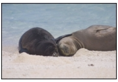
A fat Hawaiian monk seal at French Frigate Shoals rests a flipper on its mother's neck as mom and pup snooze